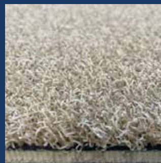
Alternate color option: Oyster Shell