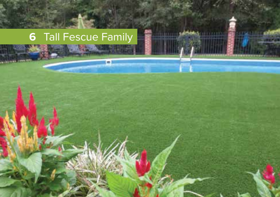
6 Tall Fescue Family