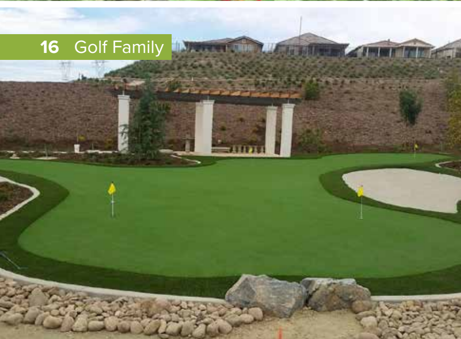
16 Golf Family