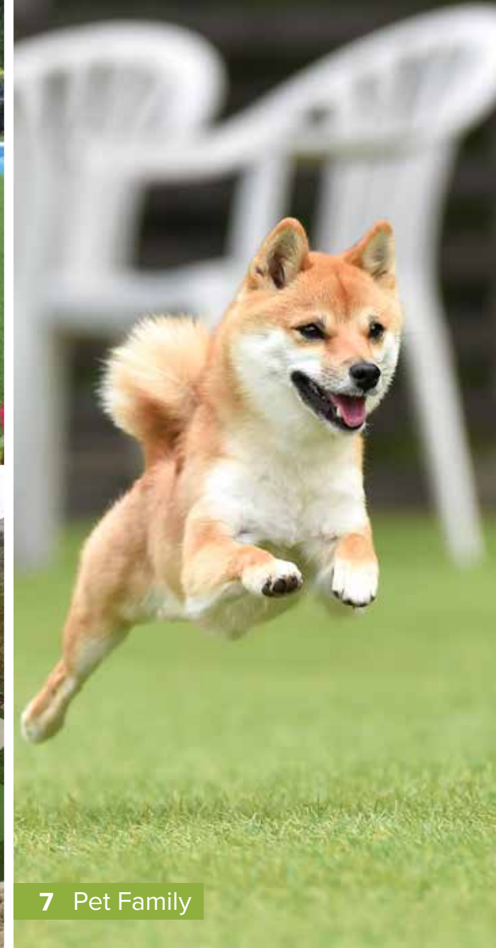
7 Pet Family