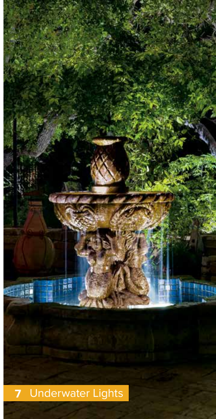
7 Underwater Lights