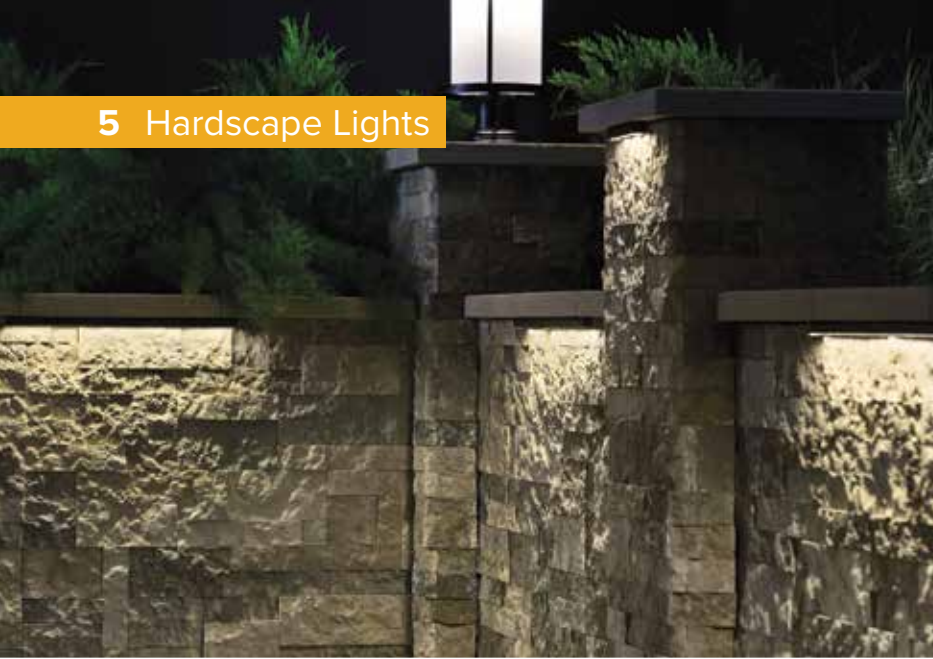
5 Hardscape Lights