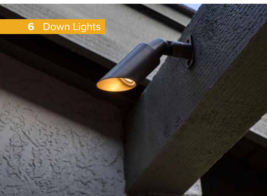
6 Down Lights