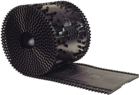
FIGURE 1—TOPSHIELD LO-OMNIROLL® TSLOR-30