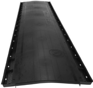
FIGURE 2— TOPSHIELD LO-OMNIRIDGE® TSLOR9-4