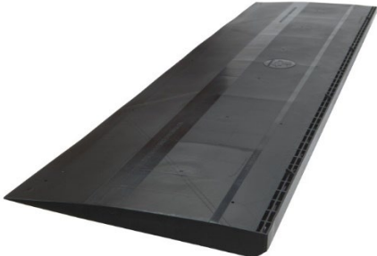
FIGURE 3—TOPSHIELD DECK-AIR® TSDA-4