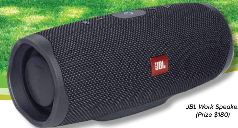
JBL Work Speaker (Prize $180)