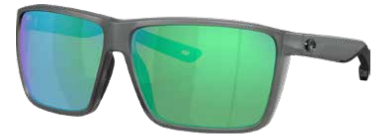
Sunglasses – Rincon II ($285 Retail)

Spend more, save more, and boost your chances to win Costa Rincon II sunglasses. For every $500 spent on a single invoice, customers receive one raffle entry.